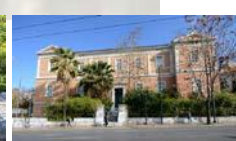
Kostis Palamas Mansion