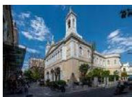
St Irene Church

5. The Church of Saint Irene in Athens is a church that was rebuilt on top of a previous medieval temple. After its reconstruction by one of the greatest architects of the 19th century, Lysandros Kautatzoglou, it was there that all official ceremonies were held. The church was designed as a three-aisled basilica with a dome, with two bell towers in Renaissance and Byzantine styles with materials from older Athenian churches and from the ruins of the Acropolis. The paintings are by painter Spyridon Hatzigiannopoulos (1820 - 1905). On several walls of the temple there are extracts of the Holy Bible, whilst two large frescoes, decorate the one the left of the sanctuary (representing the preaching of the Apostle Pavlos in the ancient Agora) and the other the north niche (the teaching of Jesus Christ in Jerusalem). The gilded templum is a gift from Tsar Nicholas II of Russia. In the church of Agia Irini, was celebrated the coming of age of King Otho A'.